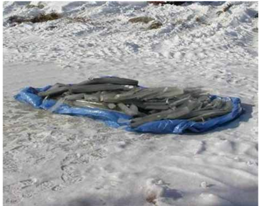
Frozen sausage casings